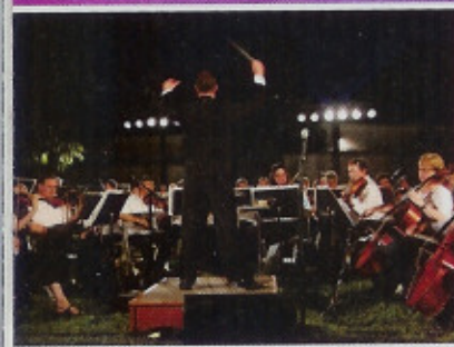
MS Symphony on the lawn of The Cedars