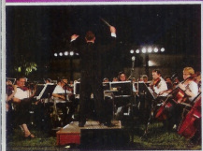
MS Symphony on the lawn of The Cedars