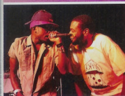
Seven thirty at SneakyFest